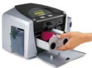
DTC400e single-sided printer

Designed for easy operation and hassle-free maintenance. The Fargo DTC400e features an all-in-one ribbon cartridge that combines a printer ribbon and card cleaning roller into one convenient unit. Just slide in the cartridge, close the door, and you're done. No feeding or tearing ribbon rolls, no fumbling with separate cleaning rollers. The integrated cartridge ensures that you'll change the cleaning roller with every ribbon change — a critical step to ensuring high-quality printing of conventional and rewritable cards.